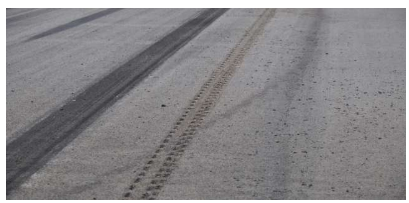
Figure 4: No. 1 Main brake assembly impact marks on the runway