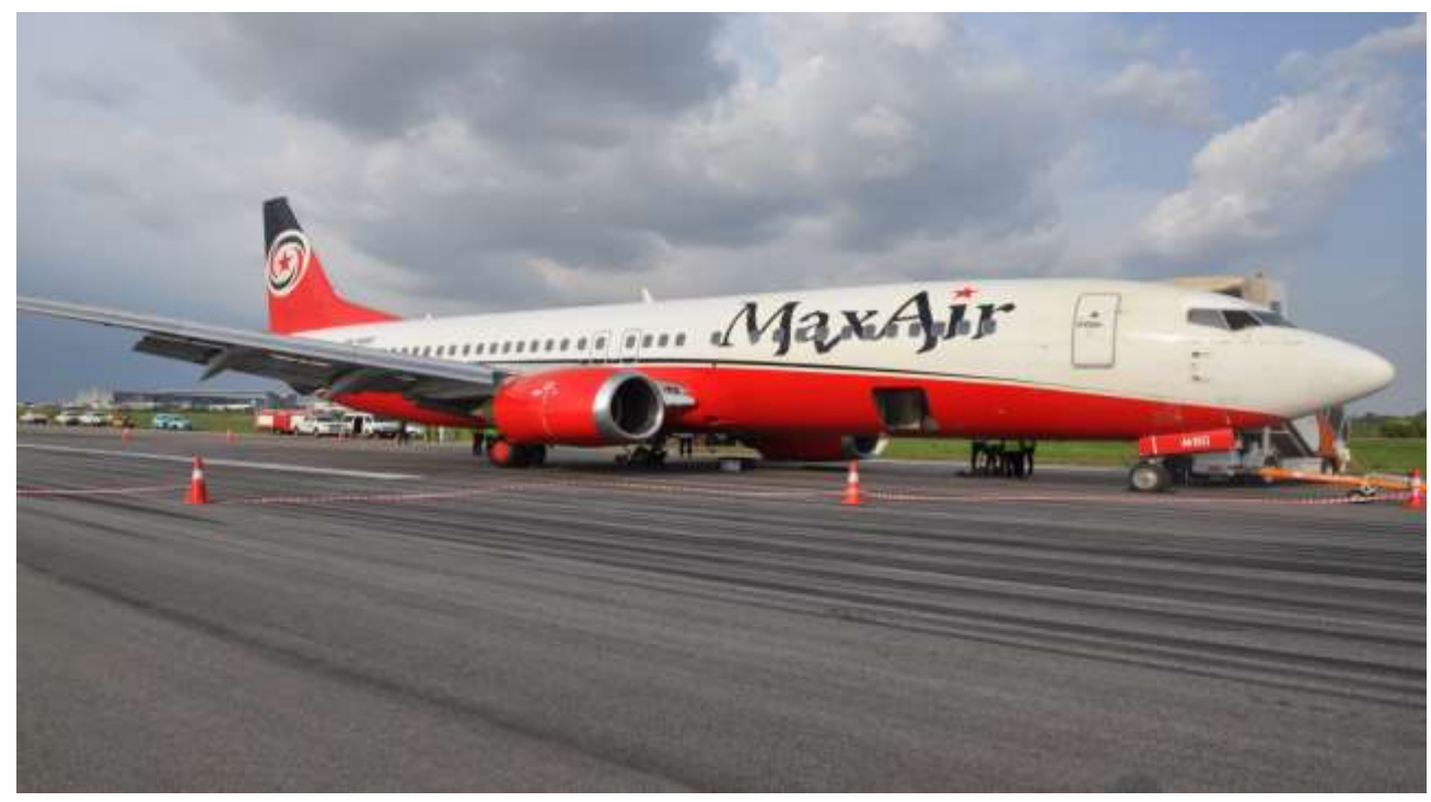
Figure 1: Boeing 737-400, 5N-MBD on the runway after the occurrence.