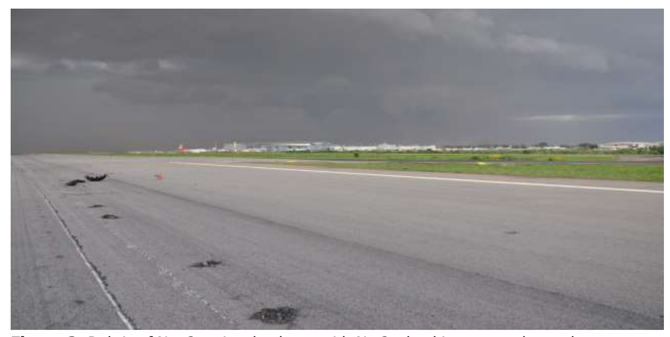
Figure 3: Debris of No. 2 main wheel tyre with No.2 wheel impact marks on the runway.