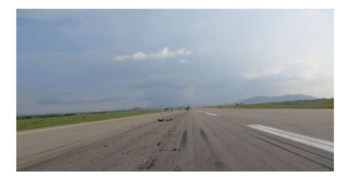
Figure 5: Debris of the No.2 main wheel tyre

veering off to the left of centerline and stopped at about 2900 m on the runway. There was evidence of severe fire damage on No. 2 main wheel assembly.