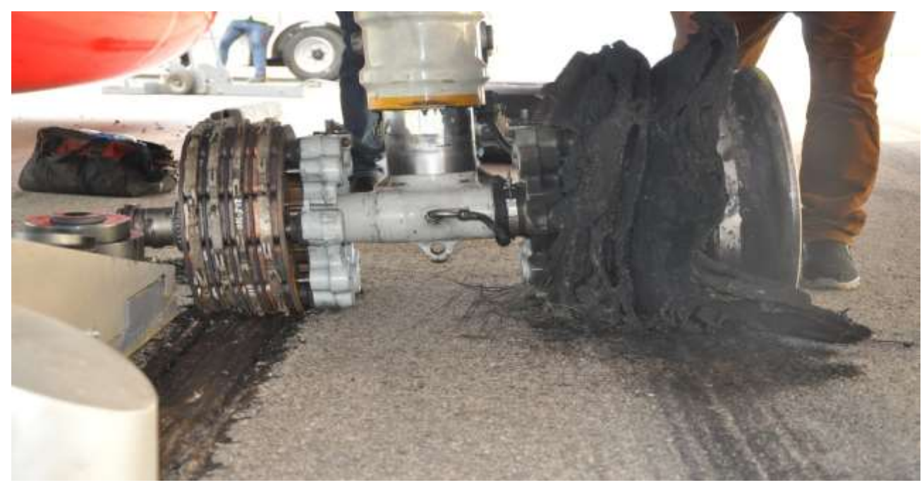
Figure 2: Damage to the No. 1 main landing gear wheels of 5N-MBD 1.4 Other damage