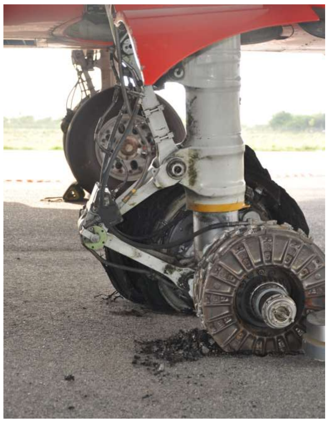
Figure 7: No.1 brake assembly with the roller bearings after the wheel fell off