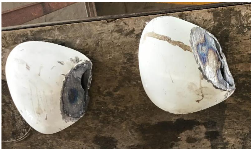
Figure 7: Broken Left and Right stairs