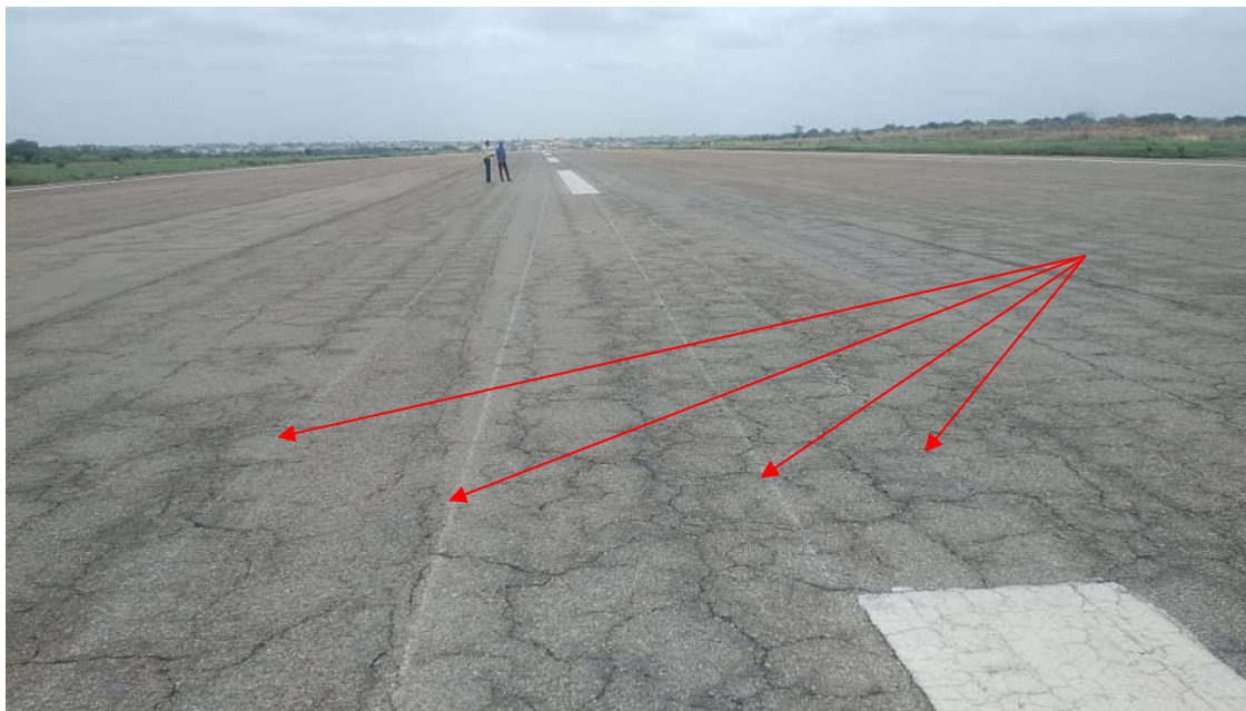
Figure 6: Skid marks made by 5N-BNH on runway 23