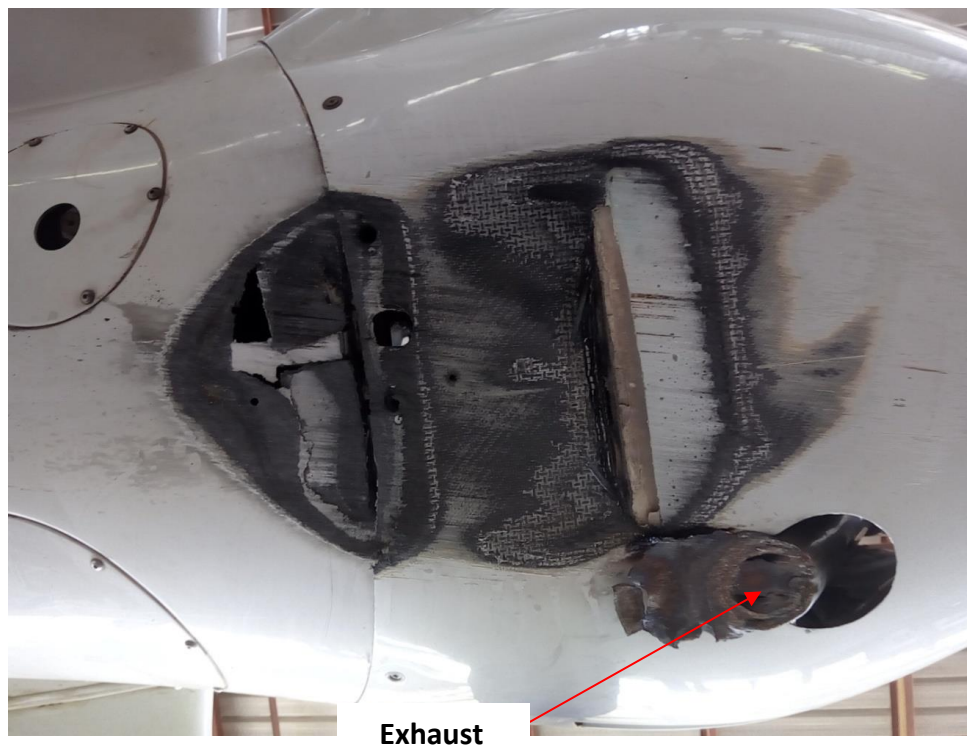
Figure 2: Photo showing the base of engine cowling and exhaust after the incident