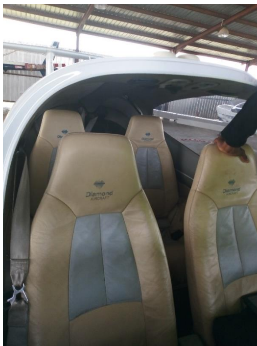
Figure 7: The cabin after the incident

The structural integrity of the aircraft remained intact after the occurrence hence there was a liveable volume for survival.