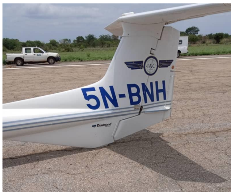
Figure 3: The tail skid of aircraft touching the runway