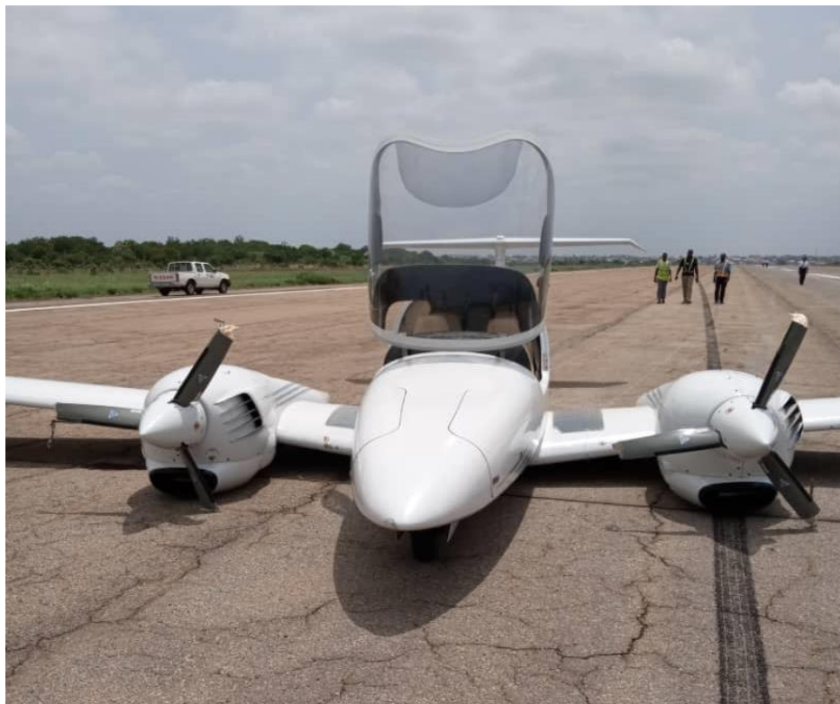
Figure 4: Final position of 5N-BNH on runway 23