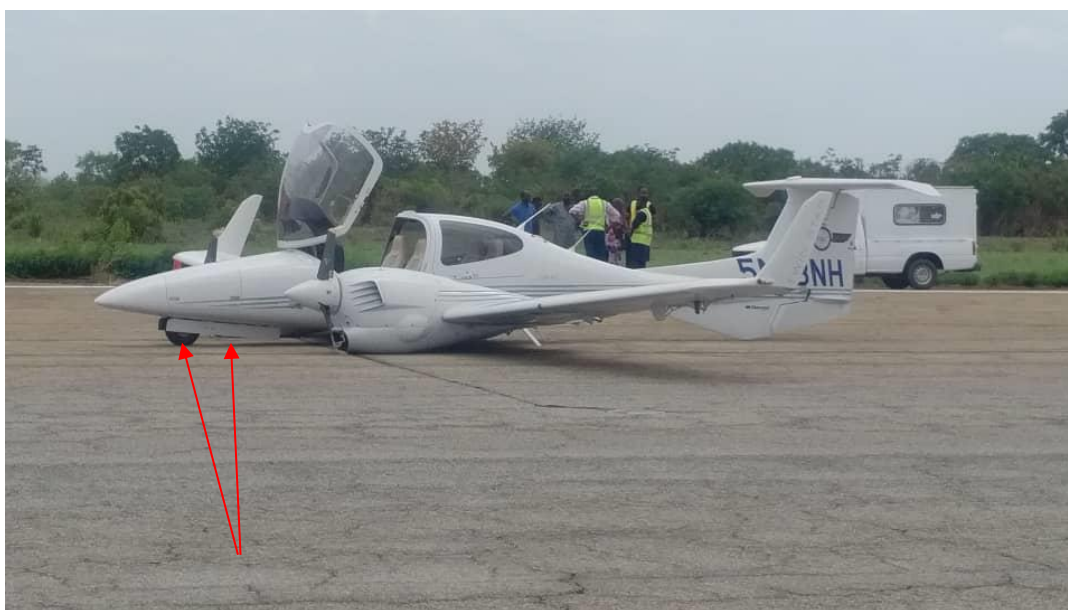
Figure 5: The nose-wheel door opened and tyre protruding